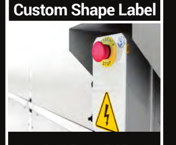
SL-S115GN YELLOW TAPE ROLL SL-R101T BLACK-C INK RIBBON